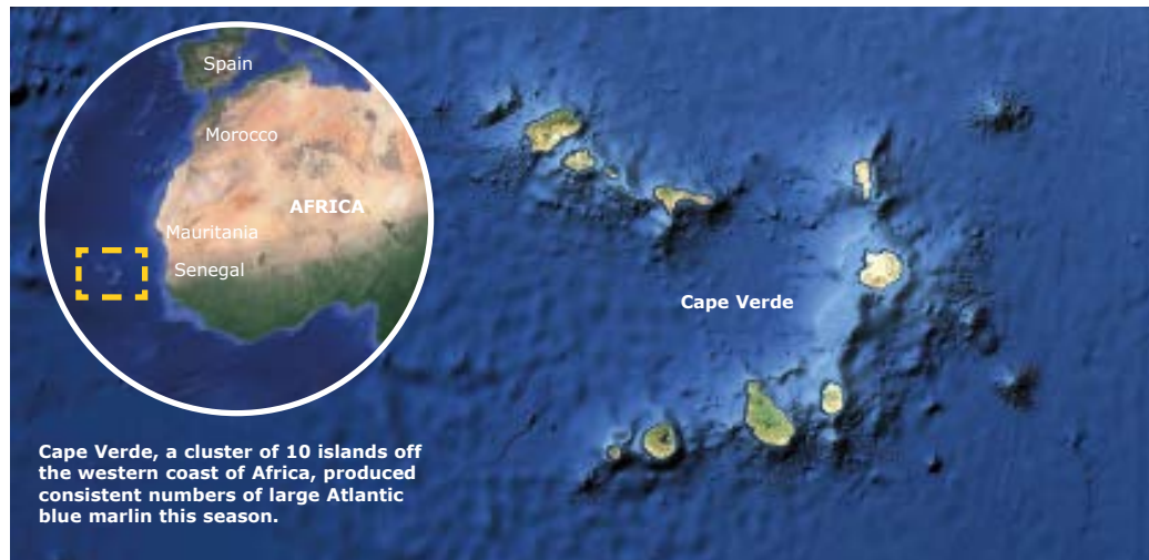
Cape Verde, a cluster of 10 islands off the western coast of Africa, produced consistent numbers of large Atlantic blue marlin this season.

We had 11 boats compete in the Blue Marlin World Cup, held on the 4th of