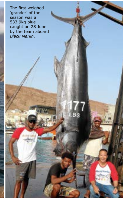
The first weighed 'grander' of the season was a 533.9kg blue caught on 28 June by the team aboard Black Marlin .